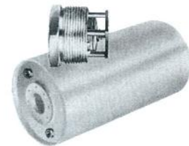
Two DFT Vacuum Breakers used in a "dry can".

DFT® Vacuum Breakers provide effective protection against collapse of pressure vessels, tanks and rolls. They prevent condensate "back-up" when equipment is shut down or inlet steam is reduced by modulating control valves. In piping systems, DFT Vacuum Breakers are used to break siphons, prevent pipe collapse during transient pressure drops, and to provide addition of air on the downstream side of check valves to dampen water hammer.