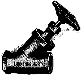
Fig. 180 Bronze with Metal Seat 300 lb SP